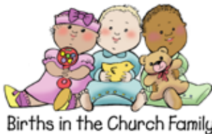
Births in the Church Family