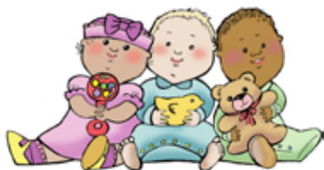
Births in the Church Family